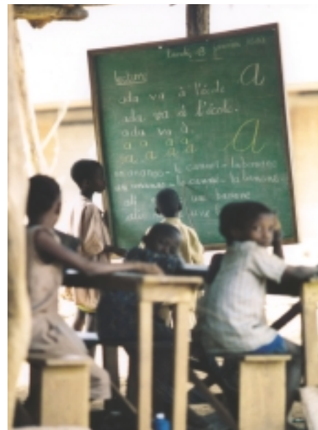
The European Union is the world's leading donor of development aid, including aid for education and for building schools.

Suppose, for example, that the Commission sees a need for EU legislation to prevent pollution of Europe's rivers. The Directorate-General for the Environment will draw up a proposal, based on extensive consultations