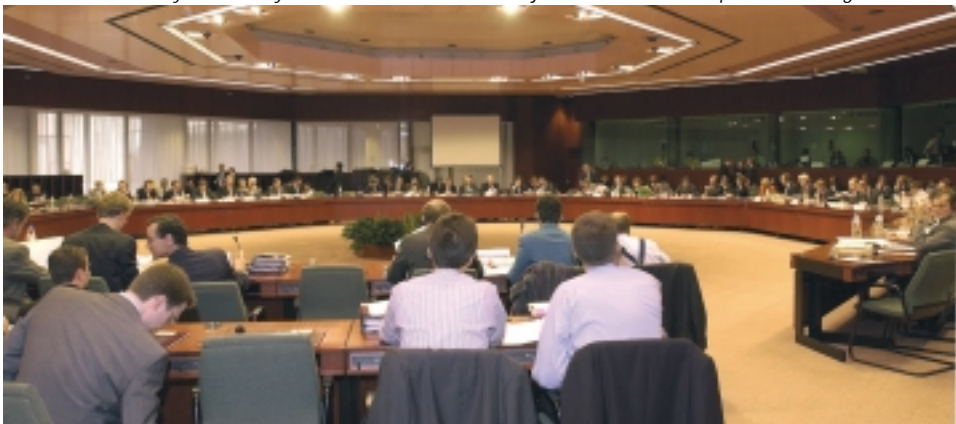
Ministers from every EU country meet in the Council to take joint decisions on EU policies and legislation.

Each year the Council 'concludes' (i.e. officially signs) a number of agreements between the European Union and non-EU countries, as well as with international organisations. These agreements may cover