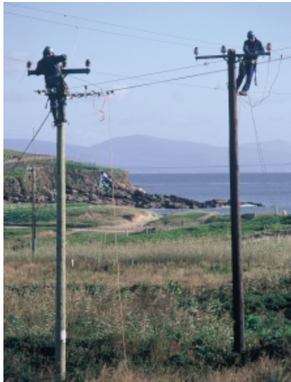
Through the Committee of the Regions, mayors and town councillors from all over Europe have their say in EU action that affects the regions – such as projects to improve transport, communications and energy networks.