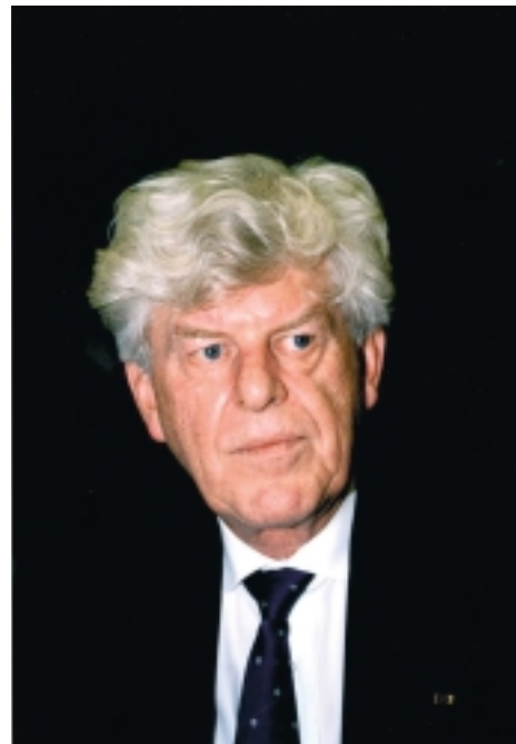
Wim Duisenberg was appointed ECB President in 1998. The Bank's main job is keeping inflation under control.

The General Council is the ECB's third decision-making body. It comprises the ECB's President and the Vice-President and the governors of the national central banks of all 15 EU member states. The General Council contributes to the ECB's advisory and co-ordination work and helps prepare for the future enlargement of the euro zone.